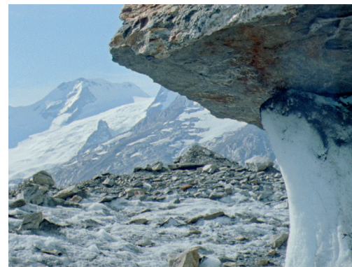
5 Laurence Favre Résistance, 2017 DCP (from 16mm Film), Colour, Sound, 11 Min.